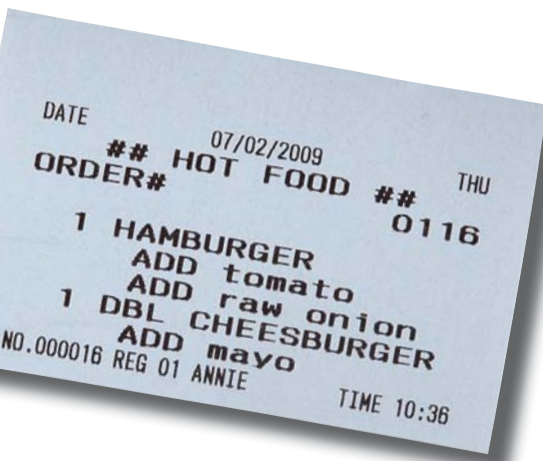
Kitchen requisition printed by the SPS-530 80mm receipt printer shown 75% actual size.